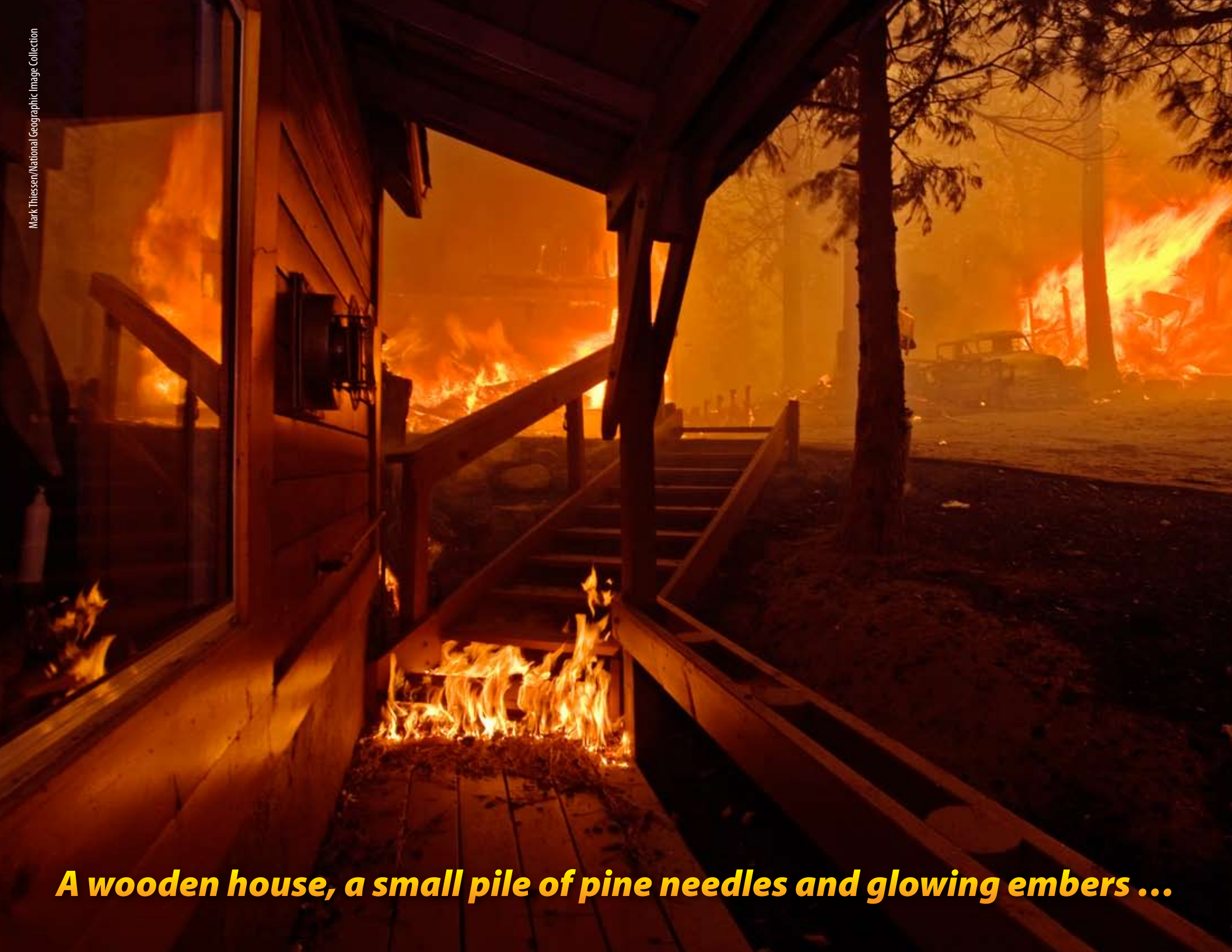
A wooden house, a small pile of pine needles and glowing embers ...