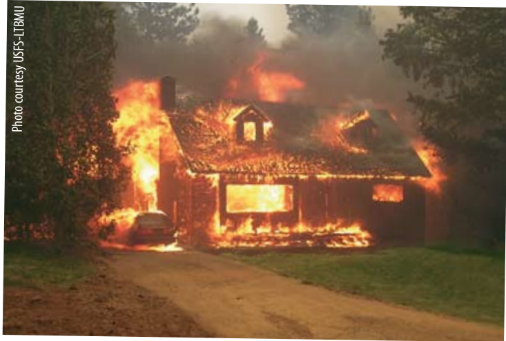
This house was ignited by burning embers landing on vulnerable spots. Notice the adjacent forest is not burning.