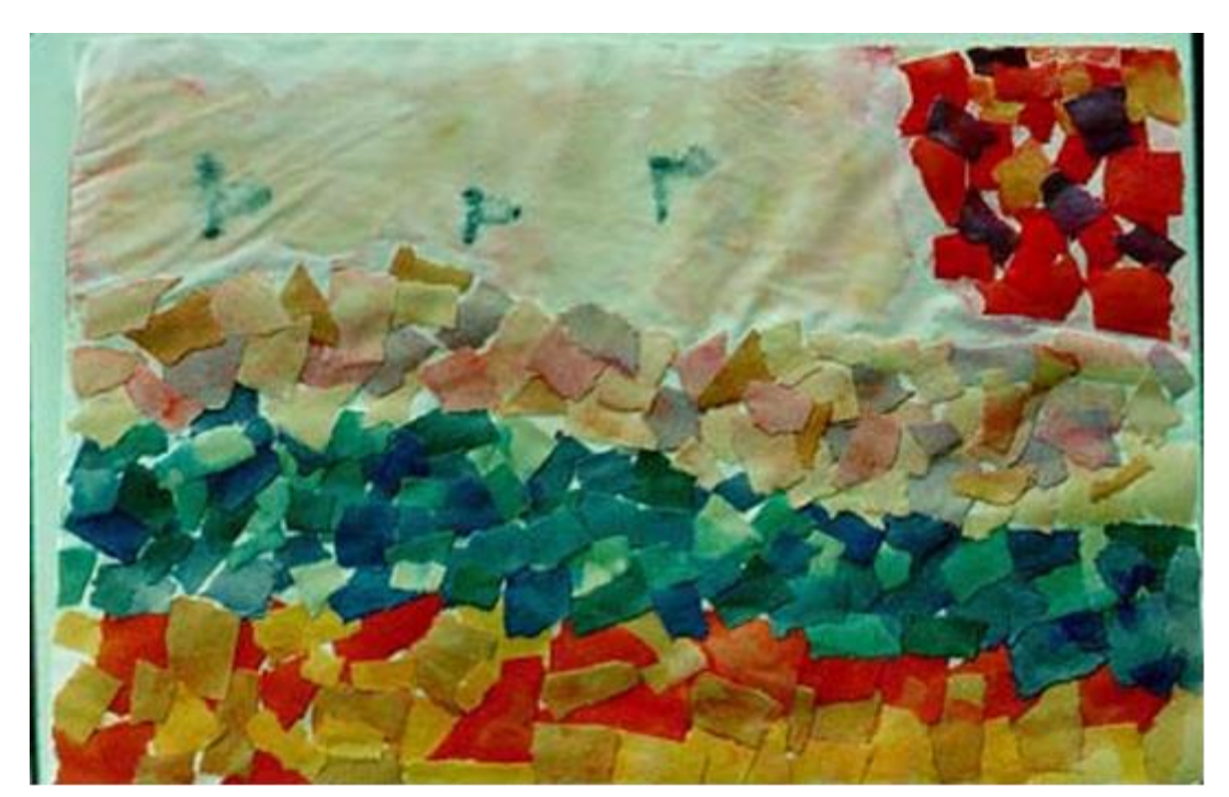
Figure 4. Making a Picture by Tearing Up and Gluing Pieces of Paper