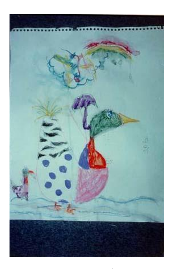
Figure 2. A Once Upon a Time Fairy Tale Drawing or Painting

kingdom where there was a hurricane (flood, earthquake, etc.)" and then let your child fill in the rest of the story by drawing or painting images of what your child thinks happened in this kingdom. Encourage your child to put animals and imagined or real characters in the drawing or painting.