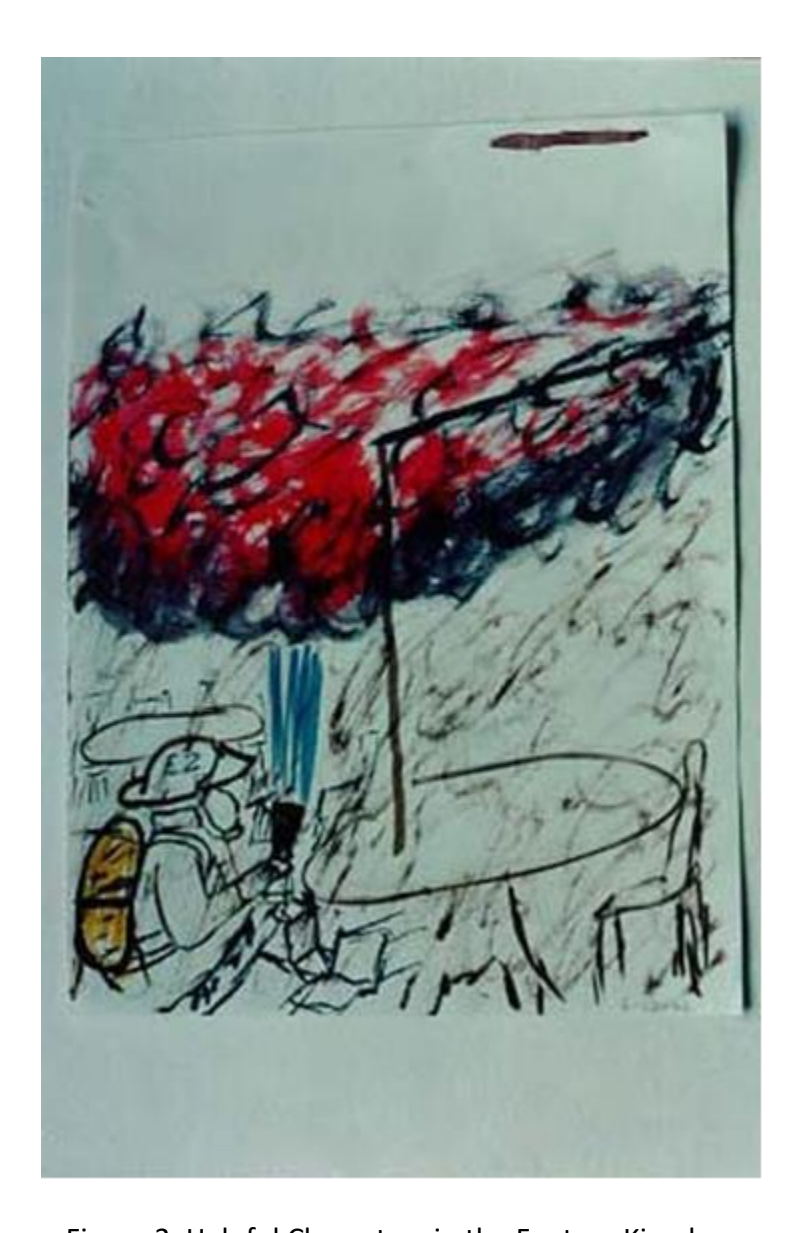
Figure 3. Helpful Characters in the Fantasy Kingdom

triangles can be used. You can also make a 3-D Play Doh or paper mache sculpture of a guardian spirit or a protective character (see Figure 5).