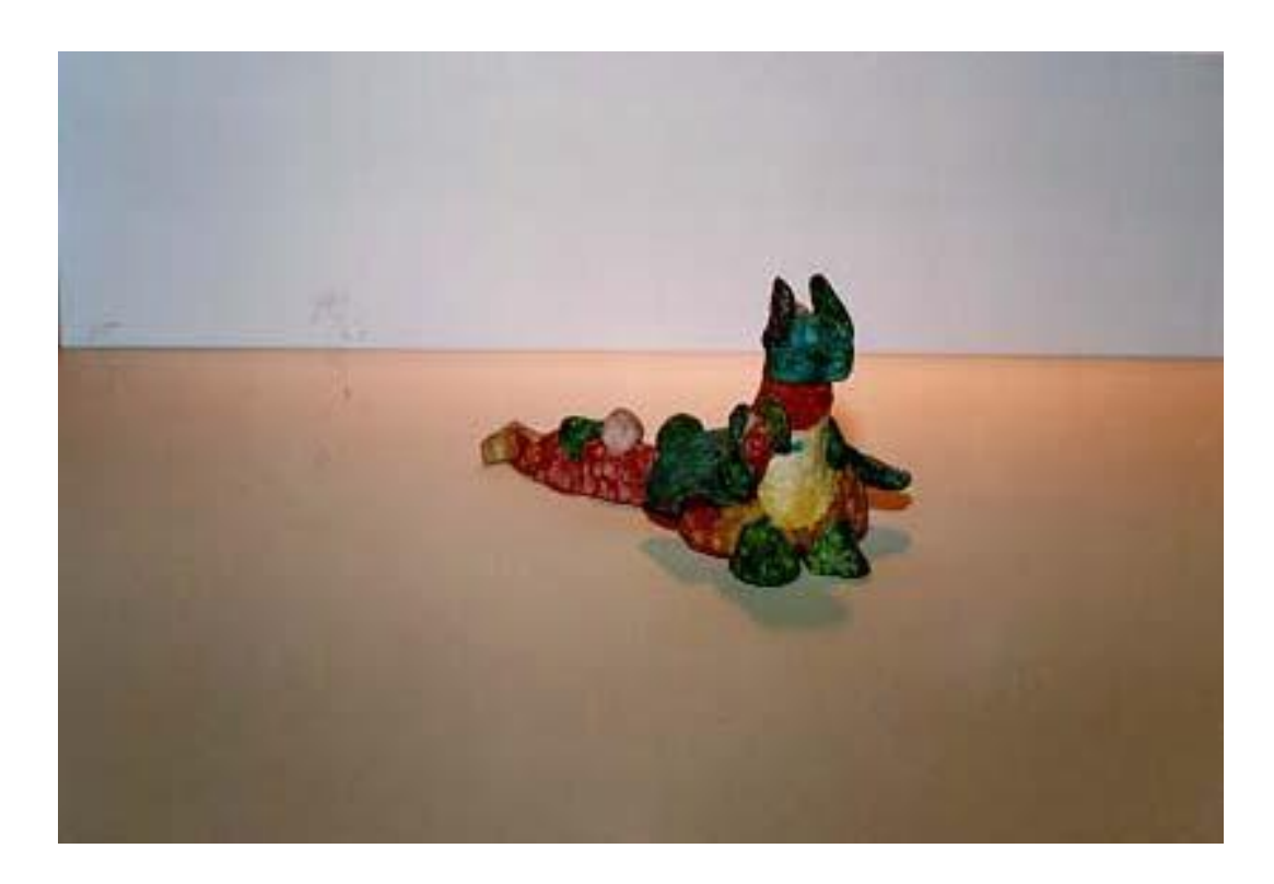
Figure 5. 3-D Guardian Spirit or Protective Figure

be put in about ideas they have had about the disaster. Another section could include ways the world is being put back together in a positive direction. For instance, how people help each other and ideas that your child might have for ways that they can help their family or others. Another section of the art journal could be called "wishes". This could include drawings or lists of wishes that the child has for himself or herself, for the family, or for other people that your child has heard about or knows. Another section could be maps or safety routes of the house, of ways to stay safe and of plans that can be made to stay safe in situations such as a disaster.