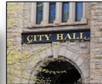
Local Government /City