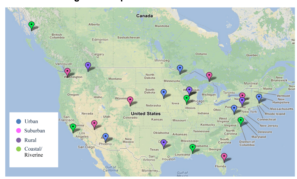
Figure 5. Map of Counties Interviewed