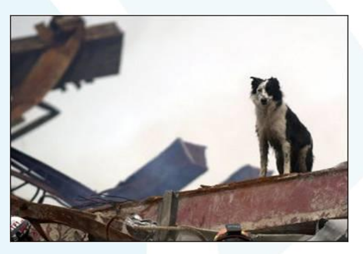
Remember to plan for us!